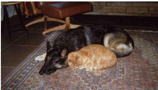
Dog and Cat!