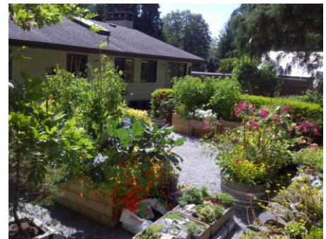
Summer growth in our back yard.